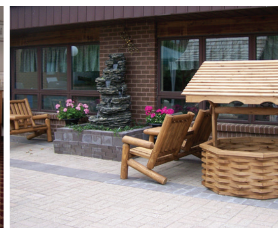
We believe it is about who cares more.

We believe in living retirement years to the fullest.